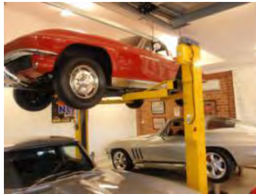
Murrays 1963 Mark of Excellence