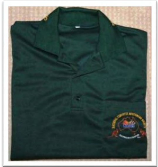
GREEN POLO $ 40.00