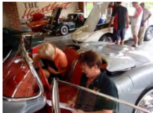
Judging in full swing

There was a great attendance of Chapter members and their cars and it was good to see the first three International Mark of Excellence cars on display for Chapter members to see.