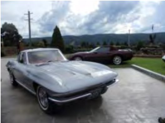
Rod Grogan's 1963 split window