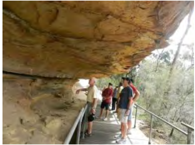
On the road to Coonabarabran, stopped to see the aboriginal hand paintings.