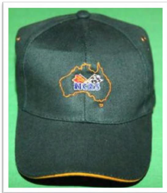
CAP $ 15.00