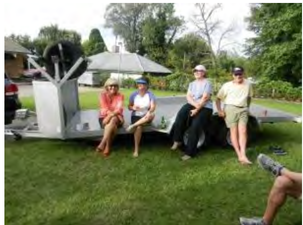
Tailgate party in Coonabarabran at our motel. Afterwards we all walked across the road to the Chinese Restaurant, WOW it was magnificent food.