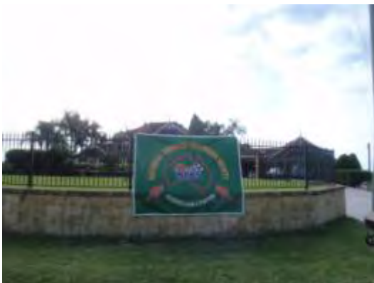
Sydney Chapter Meet venue

Once again, it was a wonderful turnout of cars and members so we look forward to our next Chapter Meet, which is coming up in Melbourne in October 19th to 20th at the Chevrolet Car Club of Melbourne.