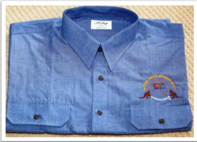
BLUE DENIM $35.00