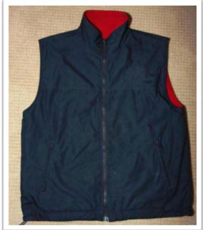
WOOLLEN VEST $38.00