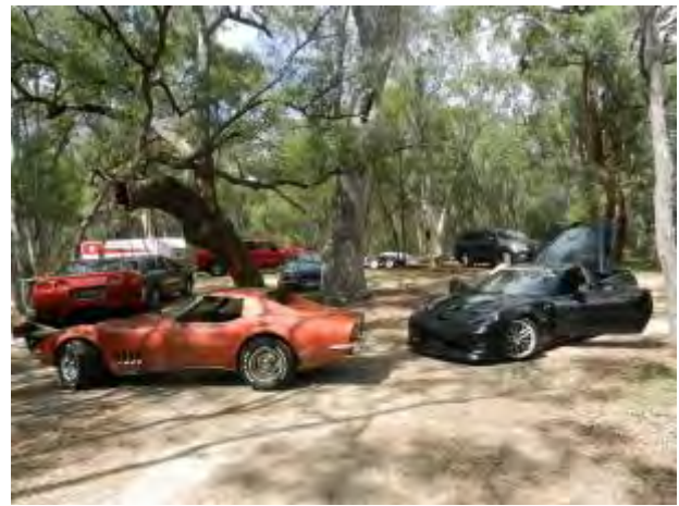
We all found the artwork interesting. The entrance to this was approx 1 km off the main road (dirt & potholes), very slow trip with the corvettes and trailers.