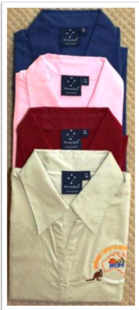
LADIES SHIRTS $ 35.00